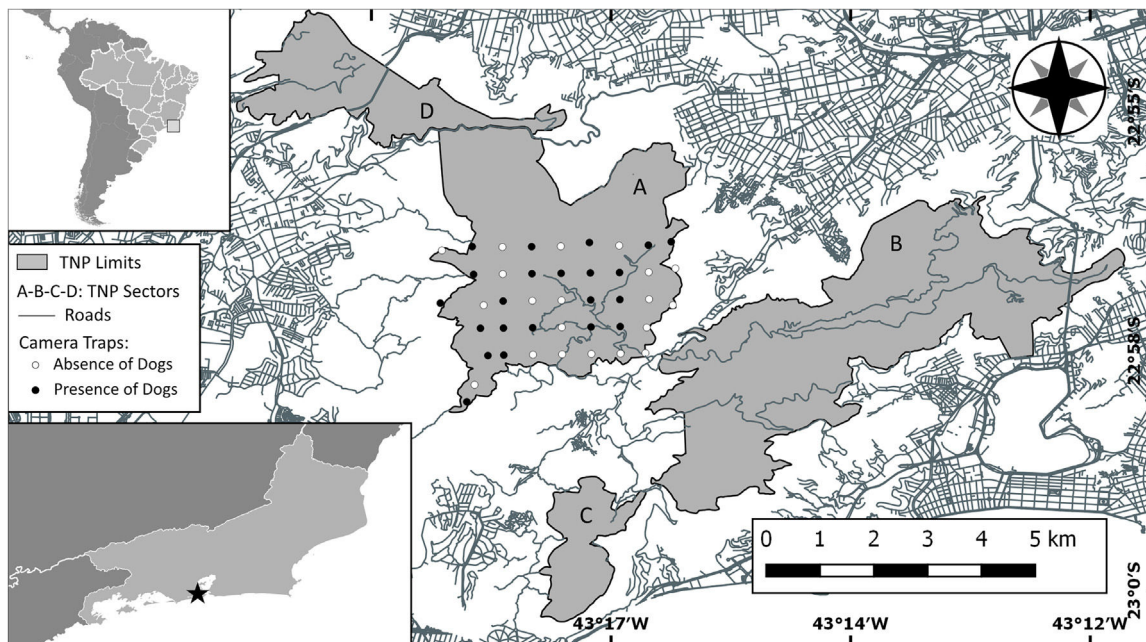
Fig. 1. Study area (Tijuca National Park) with Brazil and Rio de Janeiro insetted (TNP is represented with a black star into the Rio de Janeiro inset). Park area is showed in gray as well as his sectors: (A) Floresta da Tijuca (where the study was carried out), (B) Serra da Carioca, (C) Pedra Bonita/Pedra da Gávea and (D) Pretos-Forros/Covanca. Within the Floresta da Tijuca sector, black dots denotes camera trap stations that detected domestic dog presence, white dots denotes camera trap stations that did not detect domestic dogs. Gray lines are paved roads located inside and around the Park.

daily cycle represented the availability and the proportion of activity density in each period represented the use. Values between 0 and +1 indicate selection and values between 0 and –1 indicate rejection. To evaluate the difference in the pattern of activity between dogs and the other species, pairwise comparisons were used to calculate the overlap of the probability density distributions.