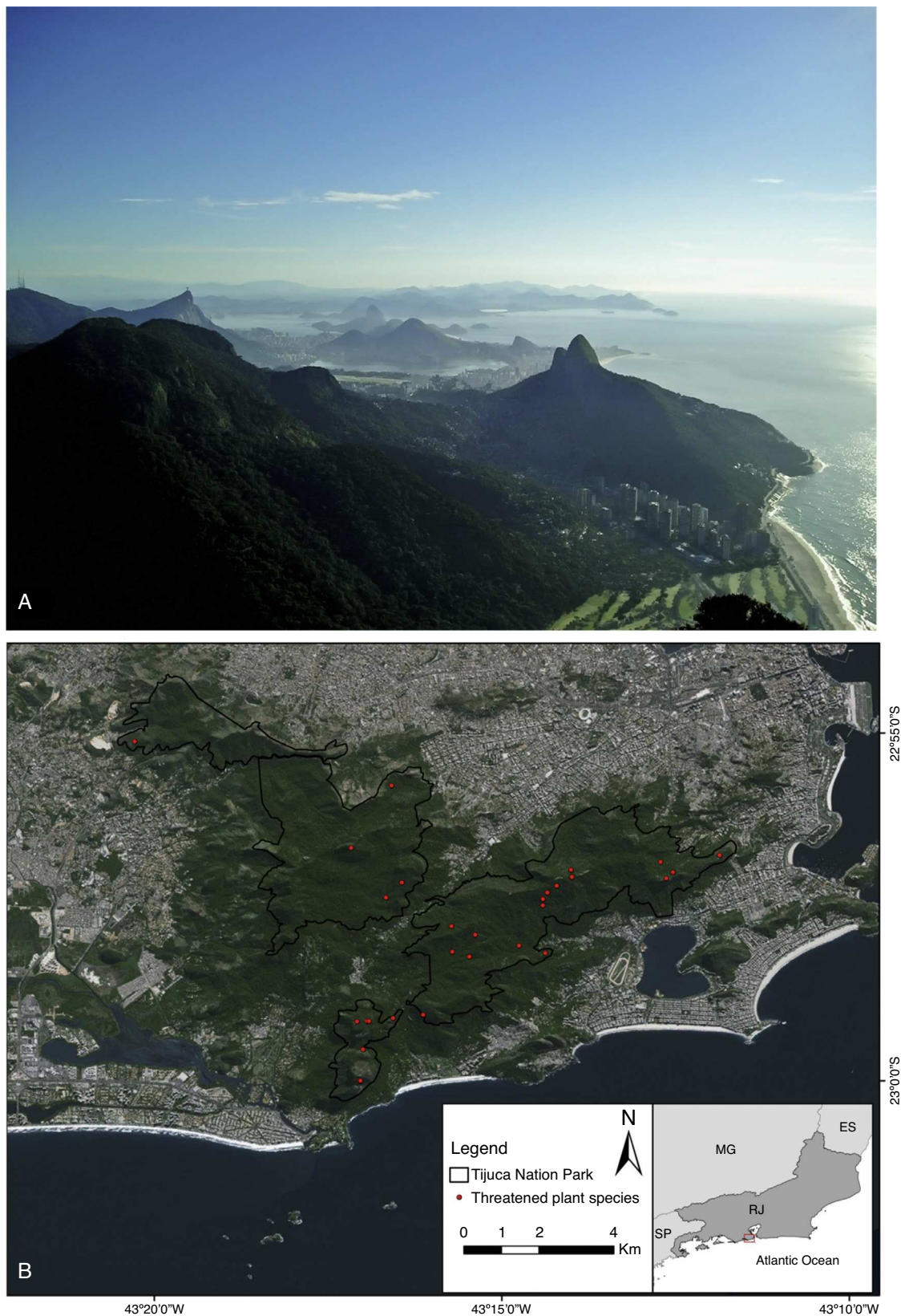
Fig. 1 – (A) View from the Tijuca National Park, the largest urban forest in the world. (B) Occurrence records for 67 threatened plant species in the Tijuca National Park, Rio de Janeiro, Brazil.