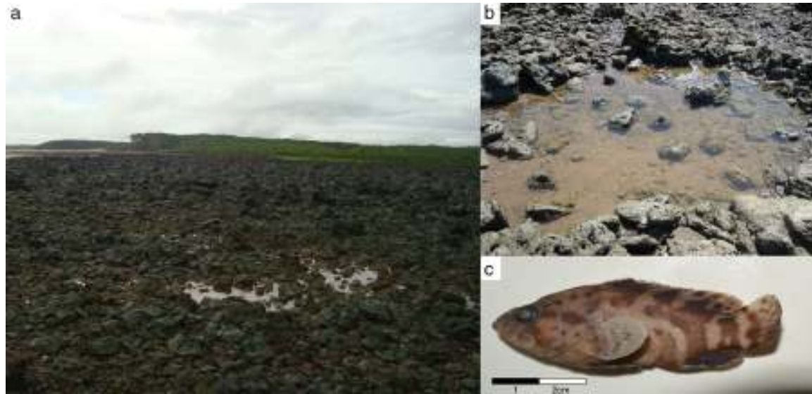
Fig. 2 – Habitat where samplings were carried out in Maiandeuá Island (Pará – Brazil). (A) Rocky shore; (B) tide pool; (C) specimen of Epinephelus itajara .

specimens were captured in the rainy season of 2011. Total length was between 31.78 mm and 89.80 mm (mean \pm standard deviation = 58.56 \pm 23.79 mm). Of these, seven specimens were measured according Smith (1971), and both morphometric and meristic data confirmed the diagnosis. The superficial temperature ranged from 30 to 38 °C ( 34.8 \pm 2.43 ), pH from 7.4 to 8.9 ( 8.1 \pm 0.46 ) and salinity from 9 to 36 ( 25.14 \pm 8.53 ).