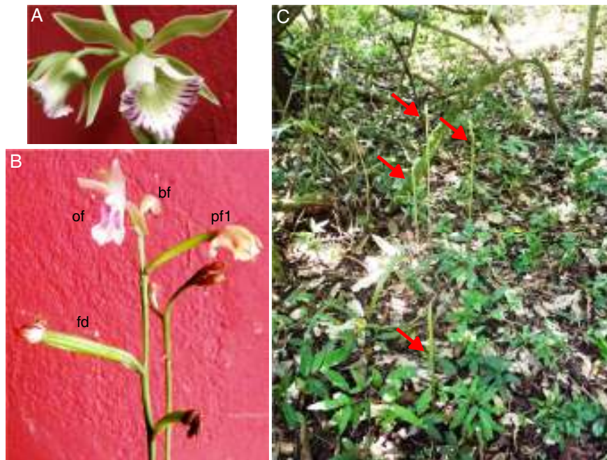
Fig. 2 – Some orchid species, Galeandra beyrichii (A) and Oeceoclades maculata (B) from environmental wild areas from the state of São Paulo under high environmental pressure. See the details of a population of restricted specie G. beyrichii in a marginal area from Rio Novo (Águas de Santa Bárbara, SP, Brazil), observed by inflorescence emission (red arrows). bf, bud flower; fd, fruit development; of, opened flower; pf, pollinated flower.

may result in an overestimation of actual populations, placing these orchids under a lower status for conservation, and consequently reducing the actual need to conserve these classes of orchids. A recent survey of the forest remnants of SP discovered only one (or no) individual of some orchid species, e.g. of the Cattleya genus, over a large sampled area (Cardoso, 2014). Furthermore, for the majority of plant species, data on population size and number of viable individuals are not readily available, making it more difficult to have accurate estimates.