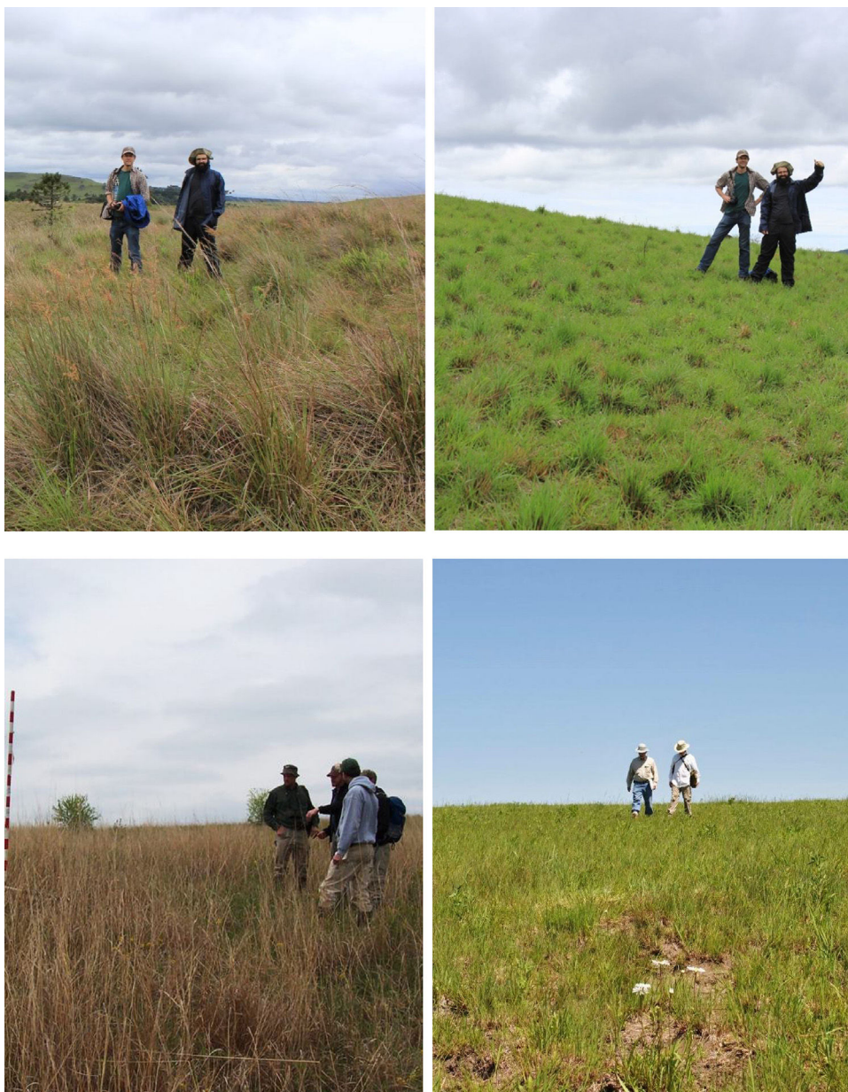
Fig. 3. Contrast between burned and unburned grassland. Top: Unburned for more than 2 years (left) and burned ~60 days prior by wildfire (right) at Parque Estadual Do Tainhas in Rio Grande do Sul, Brazil. Bottom: Unburned for more than 2 years (left) and burned ~90 days prior with prescribed fire (right) at the Grand River Grasslands in Iowa, USA.

could likely be important for conservation in SCG when grazing has been excluded, e.g. in protected areas. Moreover, the integration of grazing with fire to sustain both agricultural livelihoods and achieve complex conservation goals may be a new frontier in SCG where lessons learned in TGP may apply (Noss et al., 1995; Fuhlendorf et al., 2006; Scasta et al., 2016b).