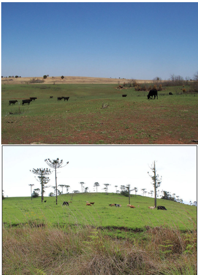
Fig. 2. Tallgrass prairie and South Brazilian grassland landscapes. Top: C4 grassland in Oklahoma, USA, in April 2016. The tallgrass in the background is unburned and the green low structure in the foreground is from a prescribed fire ~35 days prior. Bottom: C4 grassland and Araucaria angustifolia in Parque Estadual do Tainhas in Rio Grande do Sul, Brazil, in early November 2016. The tallgrass in the foreground is unburned and the green low structure in the background is a burn from late August 2016. Note that in both landscapes there is no fence between burned and unburned areas and the preference of cattle grazing in the burned area indicating an interaction between fire and grazing.

Pampa, natural grasslands have suffered a 32.9% decrease in total area from 1975 to 2005, while cover of natural forests increased by 40.7% (Oliveira et al., 2017).