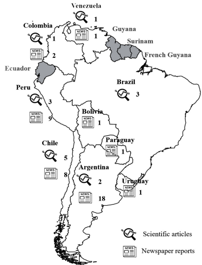
Fig. 1. Map of South America showing the number of scientific articles and newspaper reports reporting bird collisions and electrocutions with power lines discriminated by each country from 1985 to 2021. Countries with no reported bird collision or electrocution events are shown in grey.

In addition, we also obtained data provided by a citizen science project called “Aves y Tendido Eléctrico” (“Birds and power lines”)