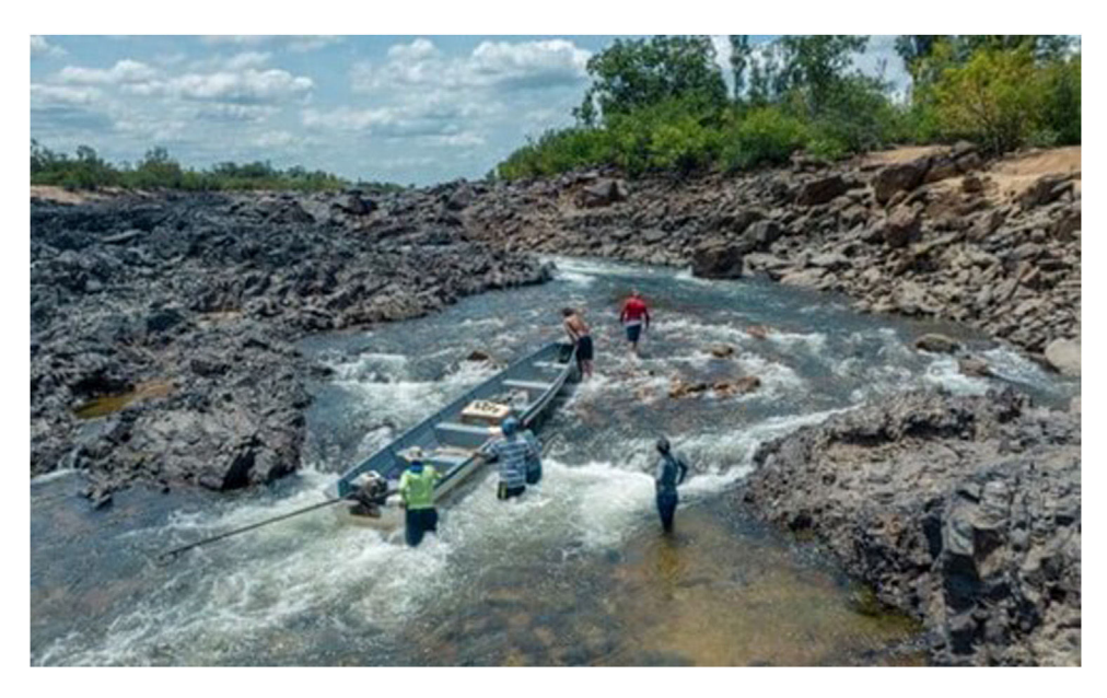
Fig. 2. Reduced water flow in the Volta Grande of the Xingu River, a 130-km stretch between the two dams that comprise the Belo Monte Hydropower Plant, decimates aquatic and seasonally flooded ecosystems, deprives traditional populations of fish and impedes transportation. Photograph: Fábio Erdos/The Guardian (Watts, 2019).

In addition, protocols for impact assessment studies have not yet been developed for the severe changes to complex and interconnected Amazonian rivers and associated flooding cycles, which impact specific habitats and species and can affect extensive seasonally flooded areas downstream of dams (e.g., Gerlak et al., 2020; Latrubesse et al., 2017; RTAC/USAID, 2020; Schöngart et al., 2021). The protocols employed by staff hired by Norte Energia systematically fail to find any significant impacts, despite the disruption being obvious to local people and to independent researchers (Pezzuti et al., 2018; Zuanon et al., 2019). The environmental impact assessment for Belo Monte (Brazil, ELETROBRÁS, 2009) severely underestimated virtually all impacts of the project (Magalhães and Hernandez, 2009; Ritter et al., 2017). In addition to environmental impacts, multiple violations of human rights were committed in implementing the dam project (e.g., AIDA, 2018). Brazil's press coverage of Belo Monte and other dams has been found to downplay or ignore social and environmental impacts and to emphasize the narratives of the hydroelectric industry asserting that these dams are needed for economic progress (Mourão et al., 2022).