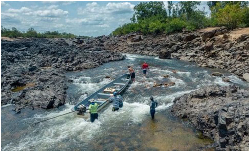
Fig. 2. Reduced water flow in the Volta Grande of the Xingu River, a 130-km stretch between the two dams that comprise the Belo Monte Hydropower Plant, decimates aquatic and seasonally flooded ecosystems, deprives traditional populations of fish and impedes transportation. Photograph: Fábio Erdos/ The Guardian (Watts, 2019).

In addition, protocols for impact assessment studies have not yet been developed for the severe changes to complex and interconnected Amazonian rivers and associated flooding cycles, which impact specific habitats and species and can affect extensive seasonally flooded areas downstream of dams (e.g., Gerlak et al., 2020; Latrubesse et al., 2017; RTAC/USAID, 2020; Schöngart et al., 2021). The protocols employed by staff hired by Norte Energia systematically fail to find any significant impacts, despite the disruption being obvious to local people and to independent researchers (Pezzuti et al., 2018; Zuanon et al., 2019). The environmental impact assessment for Belo Monte (Brazil, ELETROBRÁS, 2009) severely underestimated virtually all impacts of the project (Magalhães and Hernandez, 2009; Ritter et al., 2017). In addition to environmental impacts, multiple violations of human rights were committed in implementing the dam project (e.g., AIDA, 2018). Brazil's press coverage of Belo Monte and other dams has been found to downplay or ignore social and environmental impacts and to emphasize the narratives of the hydroelectric industry asserting that these dams are needed for economic progress (Mourão et al., 2022).